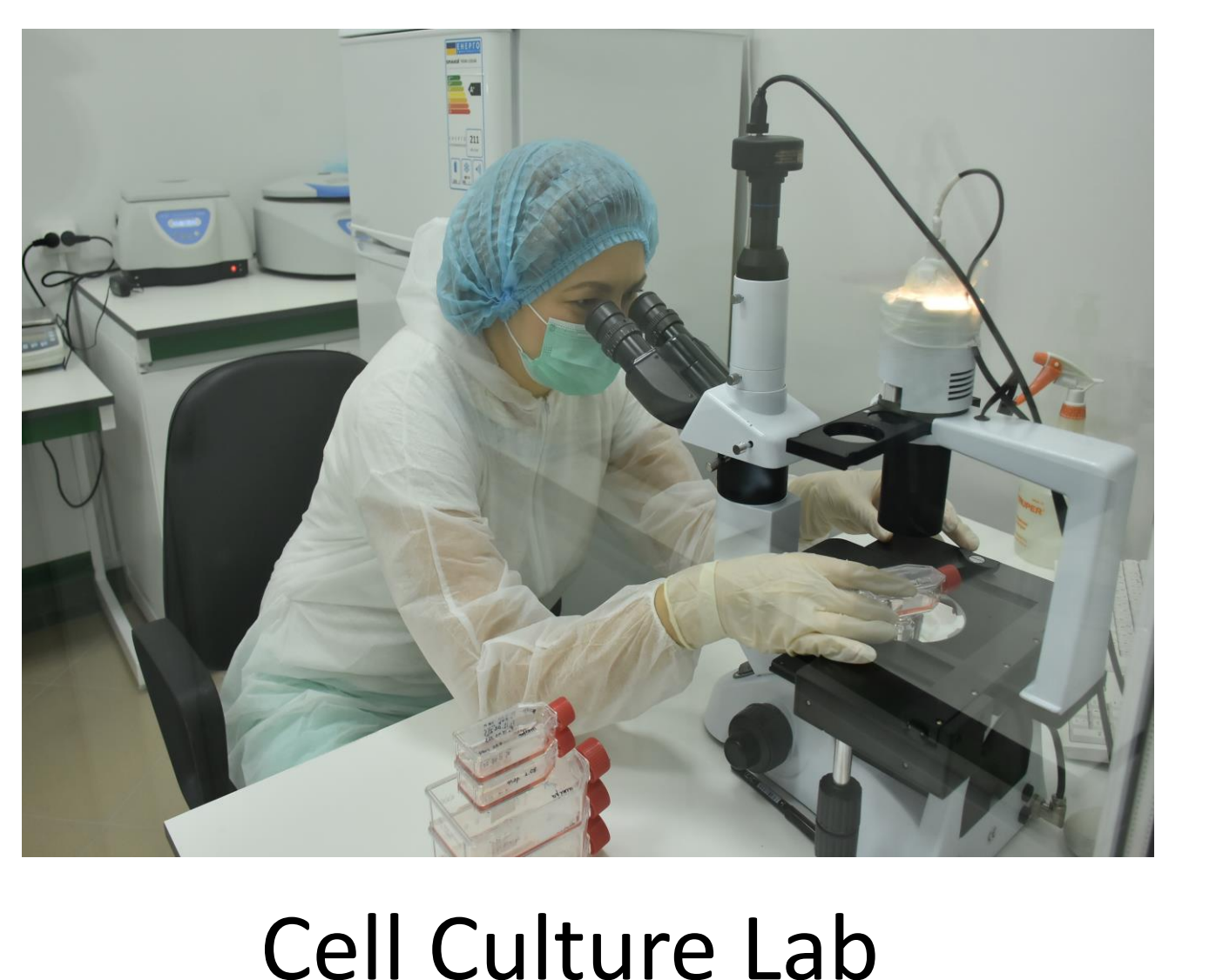
Microbiology and Parasitology Lab